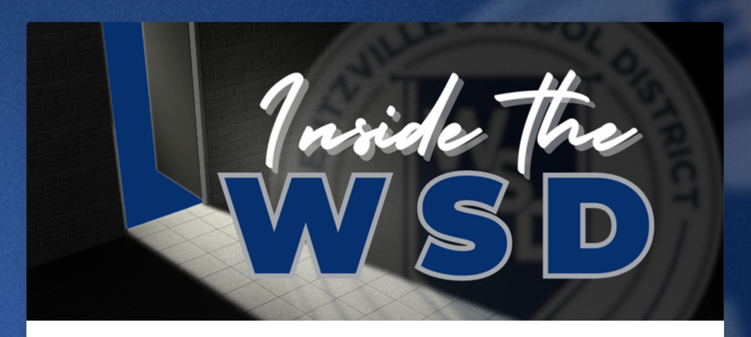
September 4, 2024

We are experiencing some formatting glitches. Click <u>here</u> to view this newsletter in a browser.